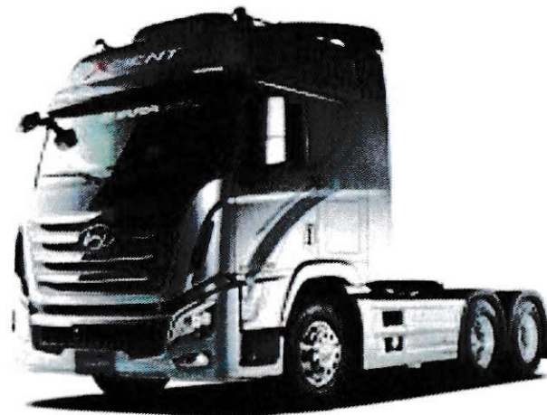
The image is an example