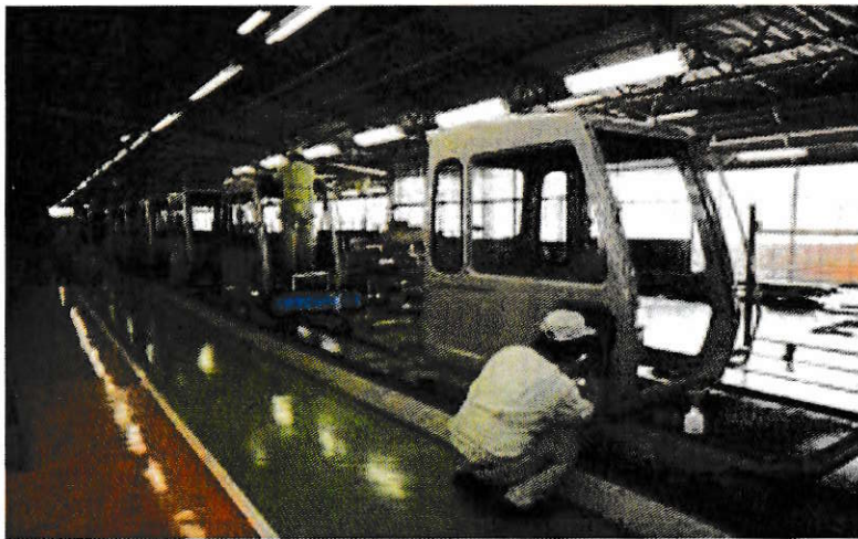
The image is an example

It removed the danger and risk of paint thinner.